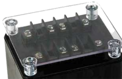
Clear Plastic Cover